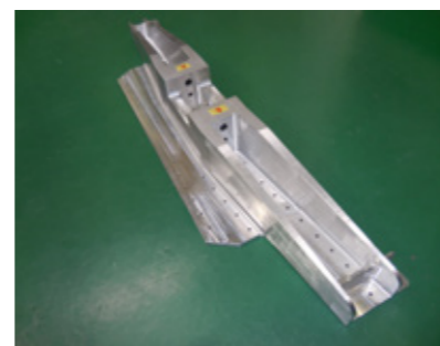
Aluminum part drilled with an angle head machine