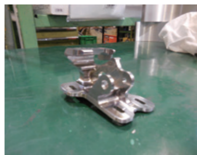
Part of hard-to-cut material