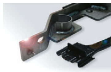
Sheet metal working