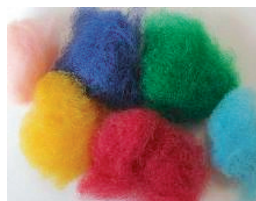
Colored short fiber