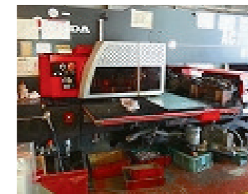
NC turret punching press