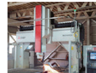
3D laser processing systems