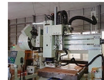
NC router processing machine