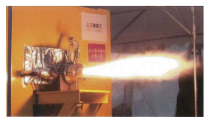
Rocket engine test equipment