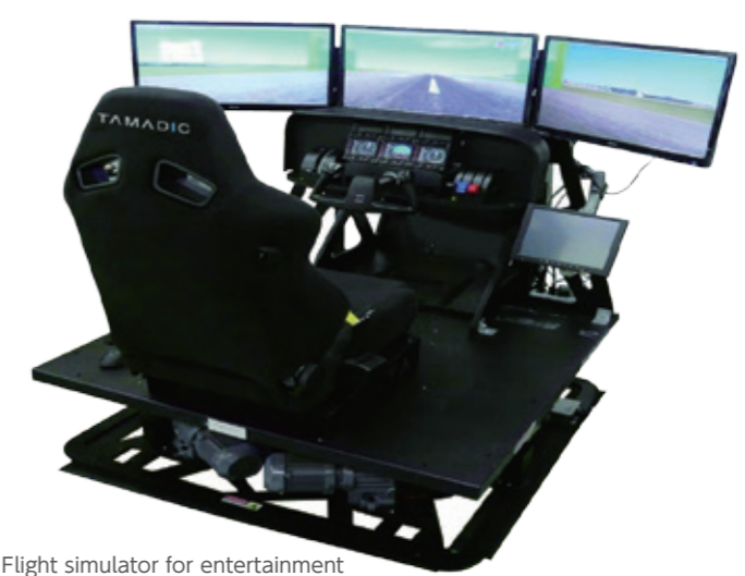
Flight simulator for entertainment

Overall know-how, experience, and high engineering capabilities based on over 50 years history in the aerospace industry.