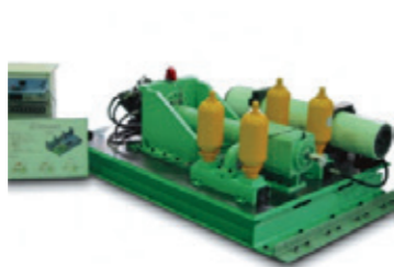
Collision test drive