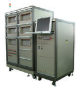
Automatic circuit testing equipment