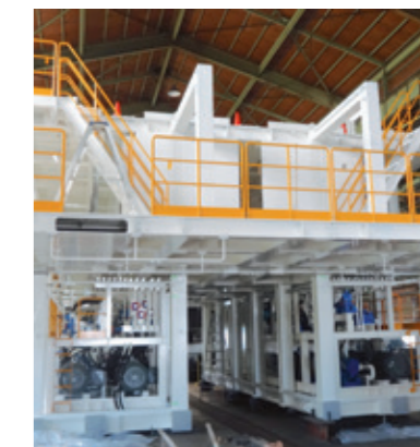
Back up trolley for shield machine with hydraulic unit