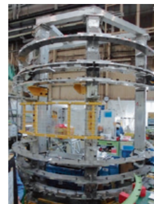
Jig for assembling framework of aircraft fuselage