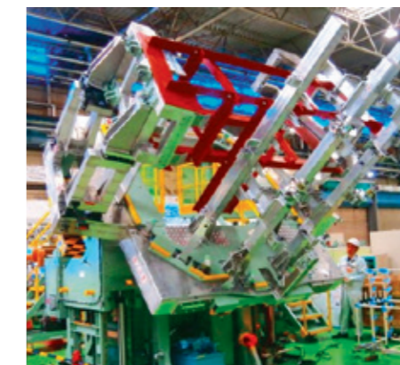
Jig for panel assembly of aircraft fuselage turning by hydraulic system